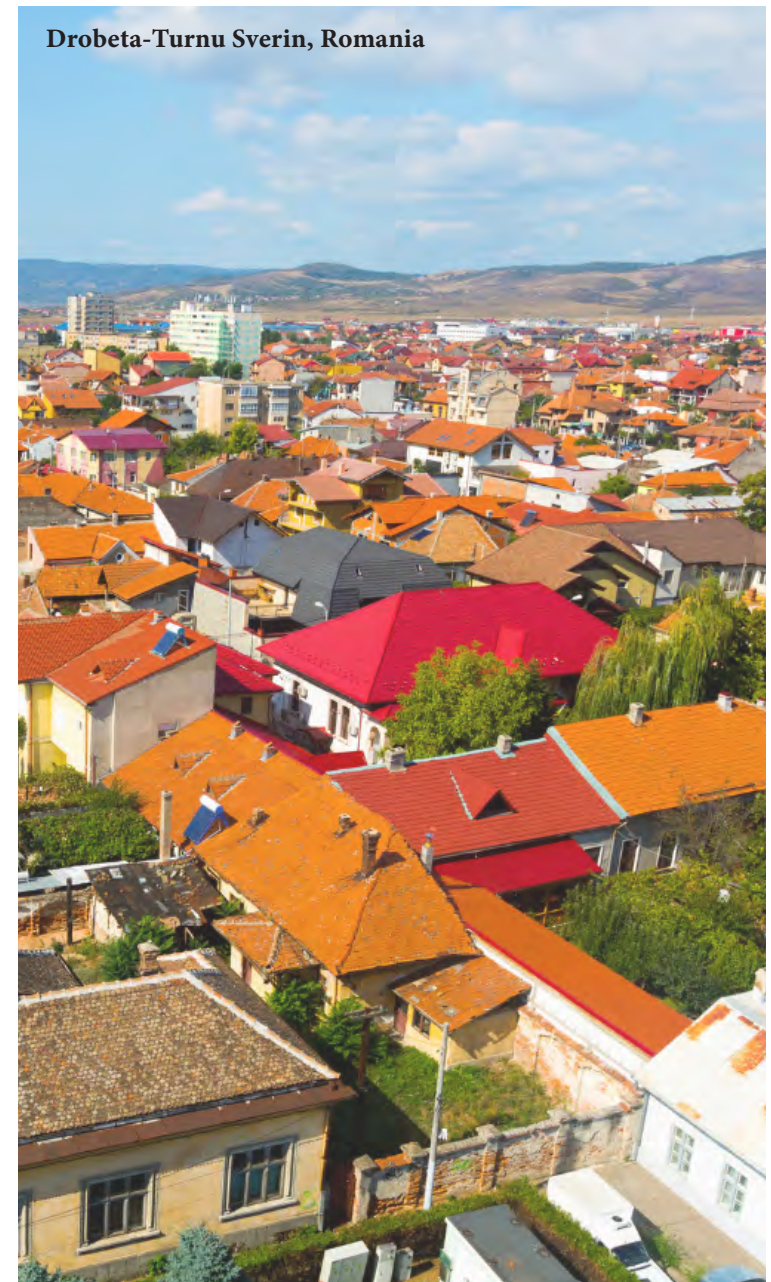
Drobeta-Turnu Severin, Romania

Drive towards the Golubac Fortress, located on a hill slope overlooking the Danube River, to visit this fortified ten-tower town. Afterward, embark on a cruise through the gorge, witnessing the most beautiful sections of the Danube. Cross the border into Romania and head to Drobeta-Turnu Severin for dinner and an overnight stay. (B, D)